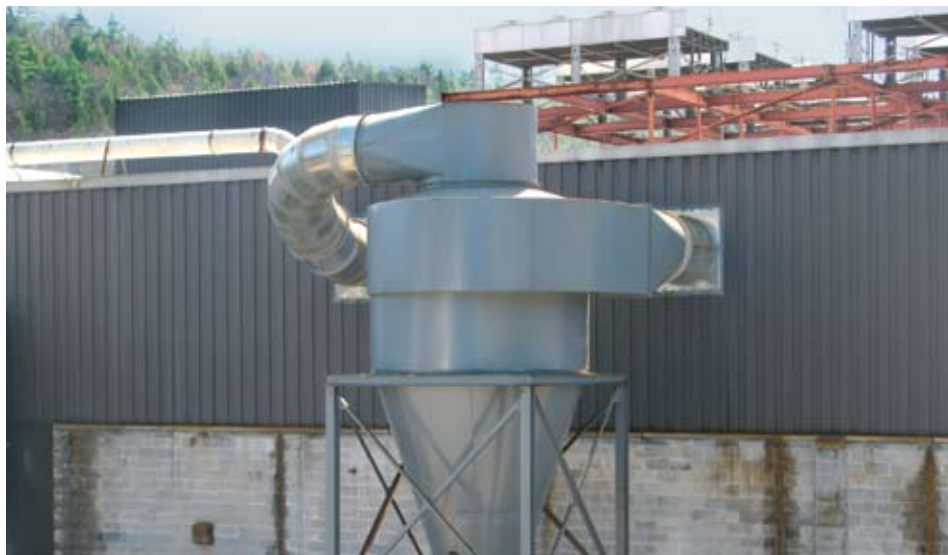
An existing dust collector was retrofitted with a cyclone, powered by a 200 HP Baldor-Reliance Super-E. This unit removes larger particulate and metallic pieces, reducing emissions by 50%.