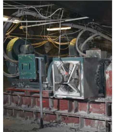
For this installation, an electric cooling fan is utilized to optimize performance. The fan is designed to maximize cooling of the reducer so it runs longer and requires less maintenance.

In this underground application, mining officials chose to use the parallel shaft configuration for a tandem conveyor drive.